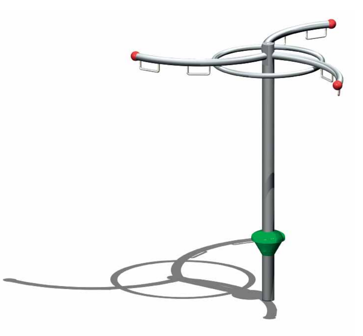
Diagram 1: Overall view of the play equipment